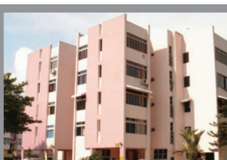
◀ Toho Garden - Singapore