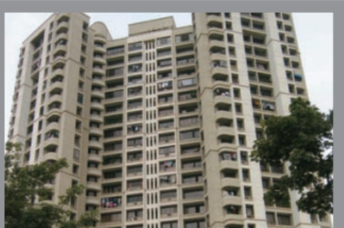
◀ Jasmine Tower Mumbai, India