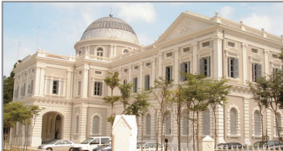
◀ NATIONAL MUSEUM - SINGAPORE

SEALFLEX incorporates the latest surface coatings and waterproofing technology and is available in a wide range of decorative colours and finishes.