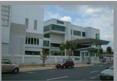
◀ Amway HQ - Malaysia