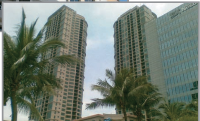
◀ JOYA RESIDENCE - MANILA PHILIPPINES