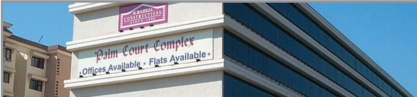
◀ PALM COURT BUILDING - MUMBAI, INDIA