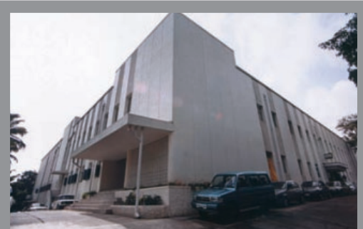
◀ Hoechst House - Mumbai, India