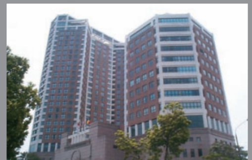
◀ Hanoi Tower - Hanoi, Vietnam