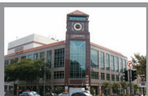
◀ Stamford Court - Singapore