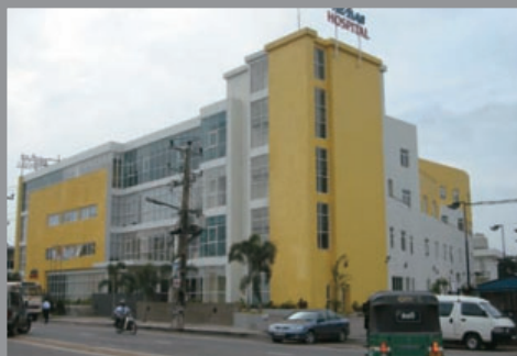
◀ Hemas Hospital - Colombo, Sri Lanka