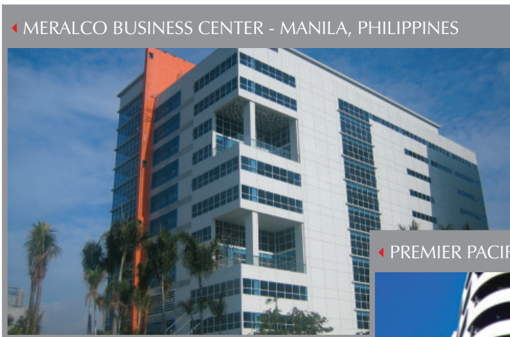
◀ MERALCO BUSINESS CENTER - MANILA, PHILIPPINES