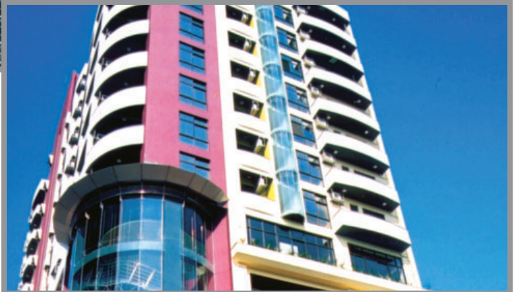
◀ PREMIER PACIFIC PINNACLE - COLOMBO, SRI LANKA