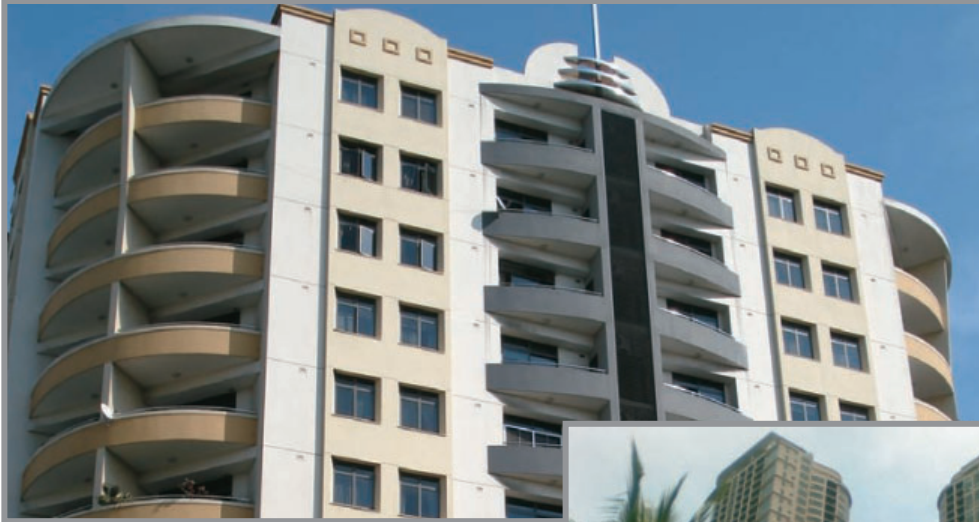
◀ HYDE PARK RESIDENCES - COLOMBO, SRI LANKA